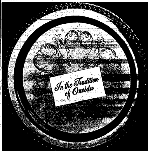
In the Tradition of Oneida

Sunday, Sunday school-church school program, St. Paul's Church, 7:30 p.m. Sunday, start of Living Nativity Scene at St. Paul's Lutheran Church, 6:30 p.m.